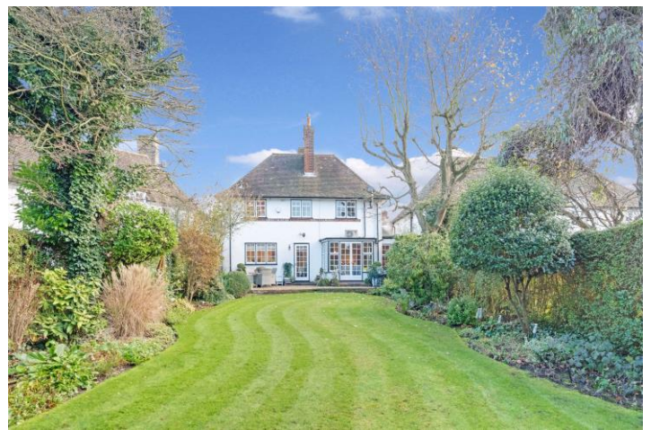
Brookland Rise, NW11